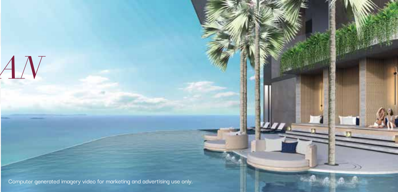
Computer generated imagery video for marketing and advertising use only.