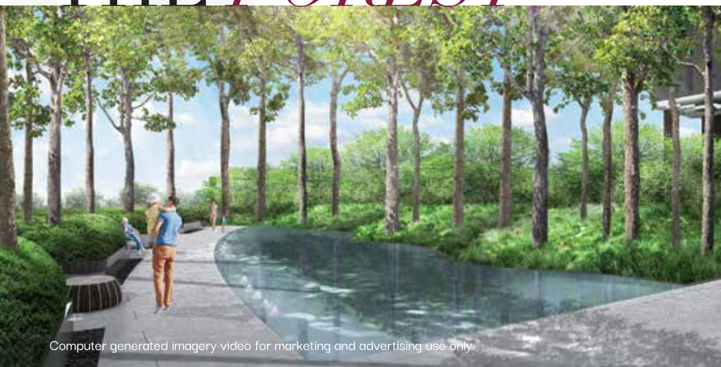
Computer generated imagery video for marketing and advertising use only.