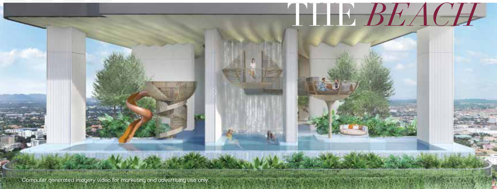
Computer generated imagery video for marketing and advertising use only.