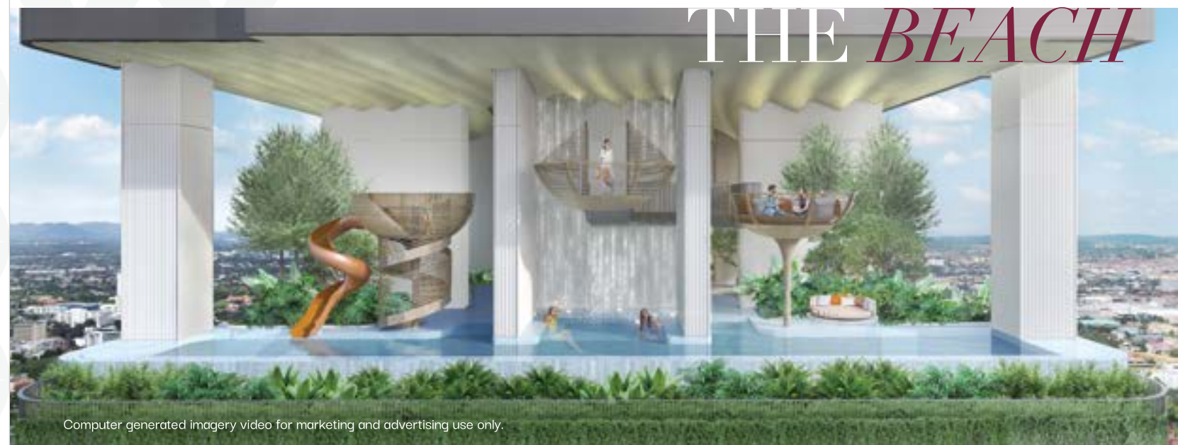
Computer generated imagery video for marketing and advertising use only.

The Beach at ONCE Wongamat is a high-altitude facility dedicated to providing a fun and engaging environment for children. This exclusive area mimics the soothing ambiance of a seaside retreat. Additionally, there is a lifestyle terrace designed for various activities and gatherings, offering spaces for personal, group, and family enjoyment. This facility brings the essence of a beach vacation to the skies, ensuring endless fun and excitement for your little ones and providing a perfect retreat for the entire family.