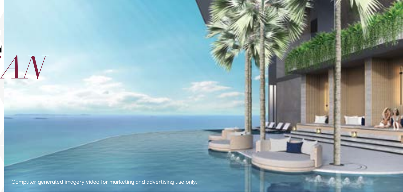
Computer generated imagery video for marketing and advertising use only.