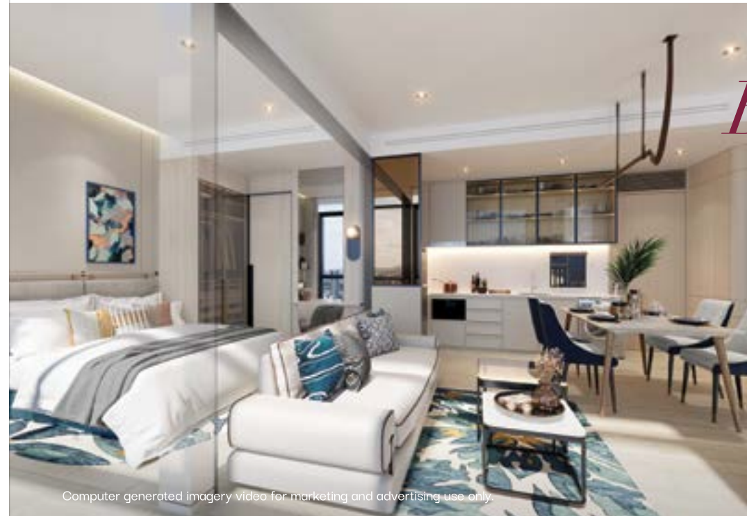
Computer generated imagery video for marketing and advertising use only.

The penthouse duplexes at ONCE Wongamat epitomize luxury living with their expansive spaces, elegant design, and breathtaking views. These residences feature double-height ceilings, premium finishes, and state-of-the-art amenities, providing an opulent and comfortable living environment. Enjoy the ultimate in privacy and exclusivity with our meticulously designed penthouse duplexes.