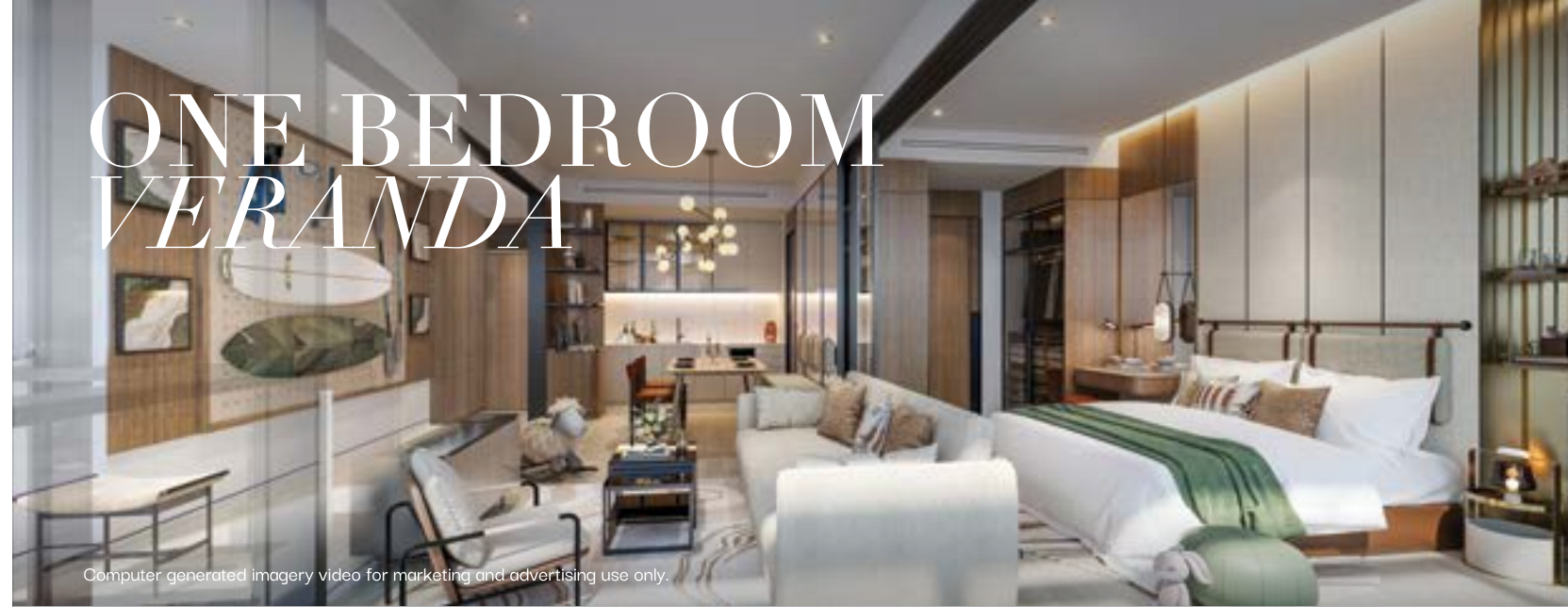
Computer generated imagery video for marketing and advertising use only.