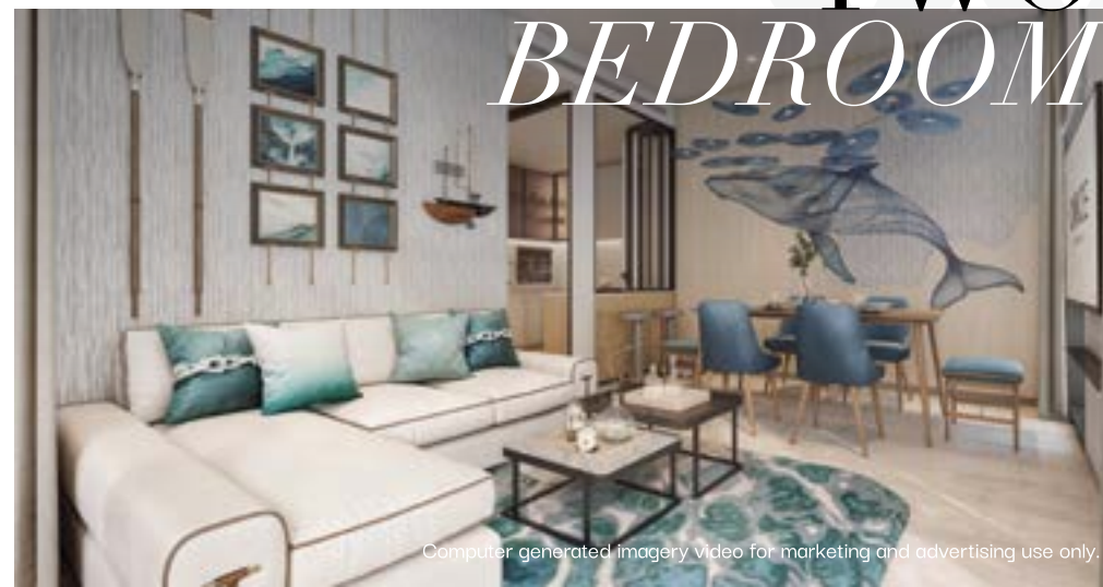
Computer generated imagery video for marketing and advertising use only.

The Veranda residences at ONCE Wongamat are designed with an emphasis on natural ventilation and airflow. Featuring spacious balconies and strategically placed windows, these homes ensure a constant flow of fresh air, creating a comfortable and healthy living environment. Experience the benefits of living in a space that truly breathes.