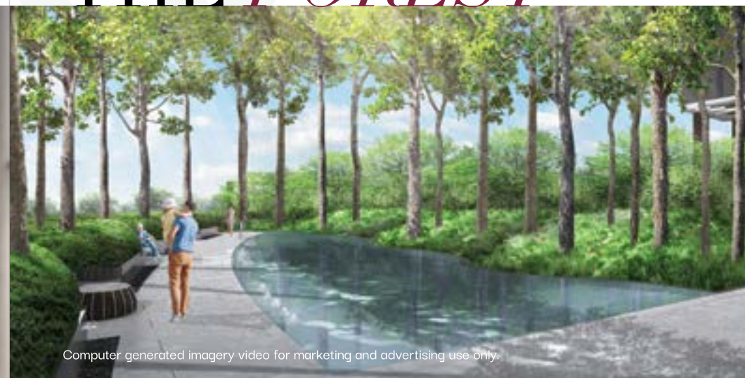
Computer generated imagery video for marketing and advertising use only.