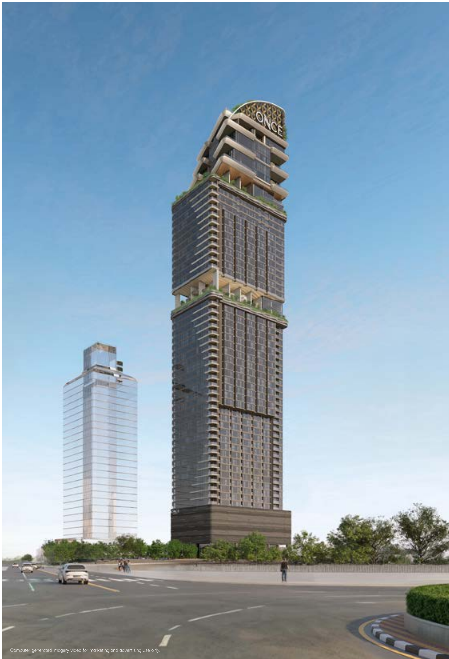
Computer generated imagery video for marketing and advertising use only.